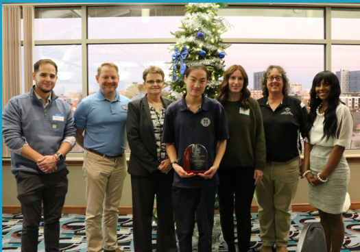
Champaign-Urbana Public Health District – Special Recognition Award