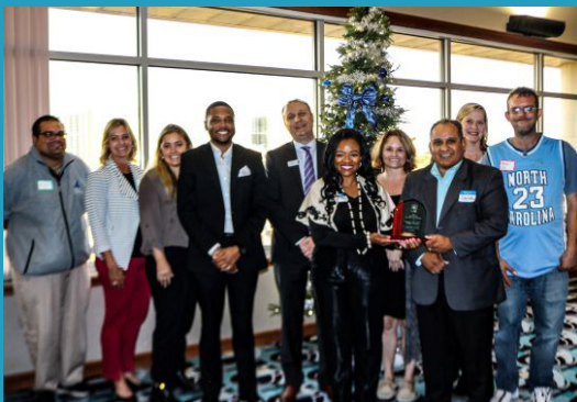
Champaign Unit 4 School District – Employer of the Year